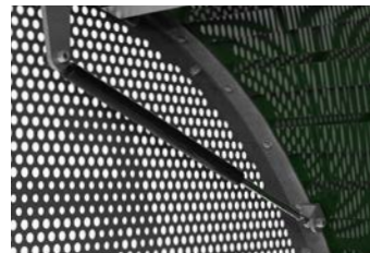
Gas sprung door