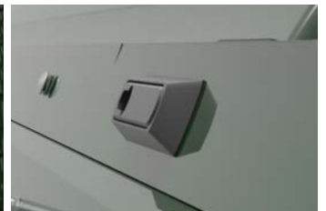
Flush vandal resistant handle