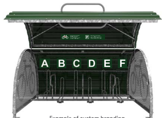
Example of custom branding