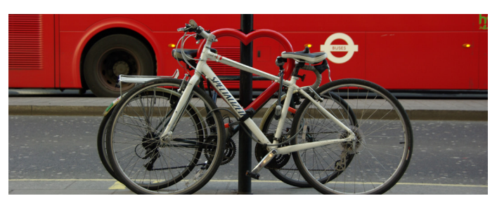
Prevents from falling over